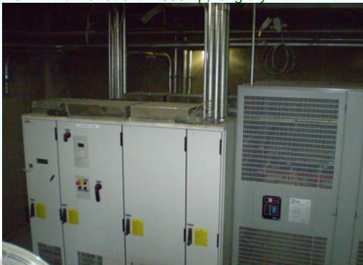
2x300hp fully redundant kiln drive VFD, 480V