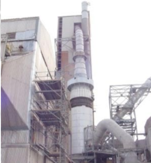
Gas conditioning tower upgrade & new P/H duct