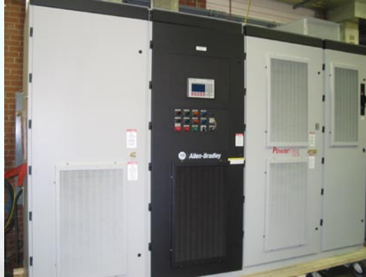
2500 hp SGBT ID Fan drive, 5kV