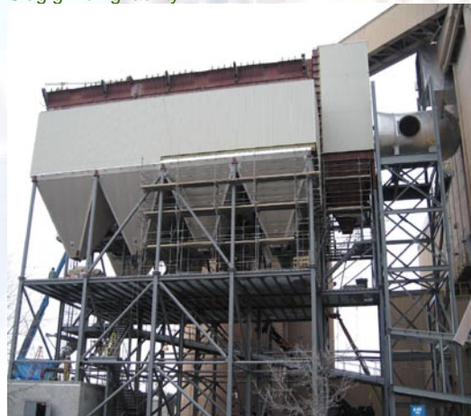
800,000ACMH/RM pulse jet BH to replace EP