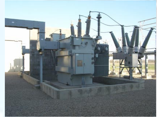
15MVA -138kV/5kV substation