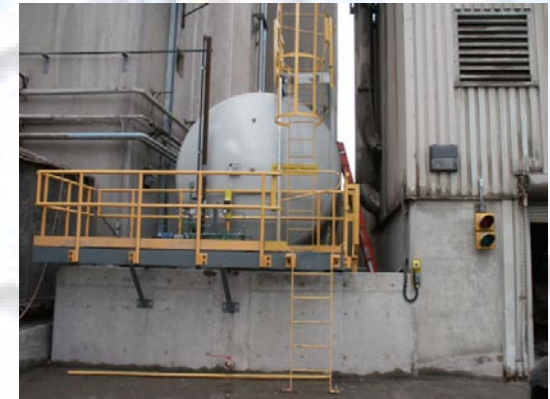
Ammonia storage tank farm 40,000lt