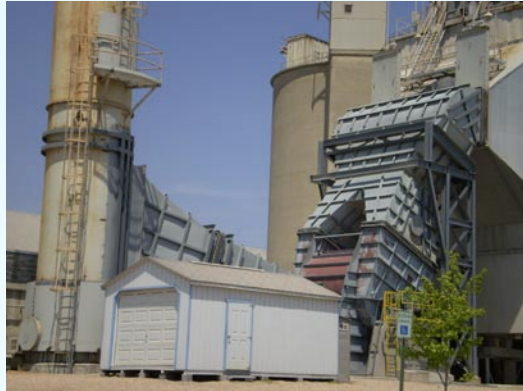
Kiln precipitator fan upgrade with new duct.