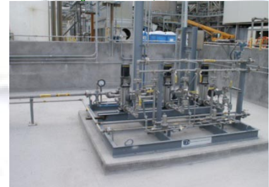
Ammonia pump skids