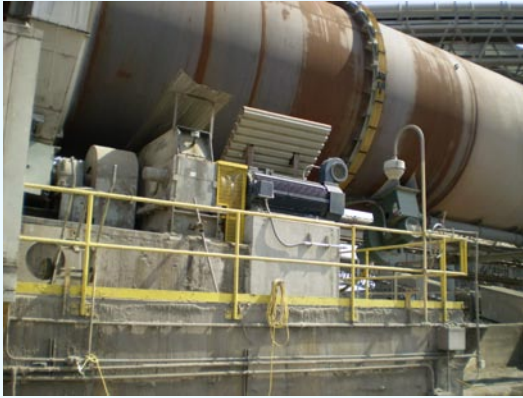
New kiln drive retrofit 2x300 hp, long dry kiln