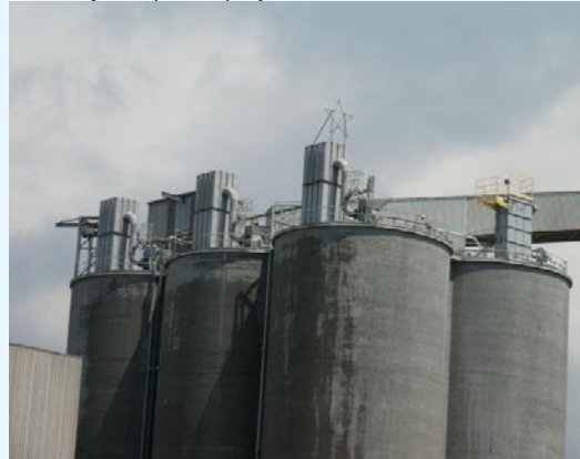
Cement storage silos dedusting