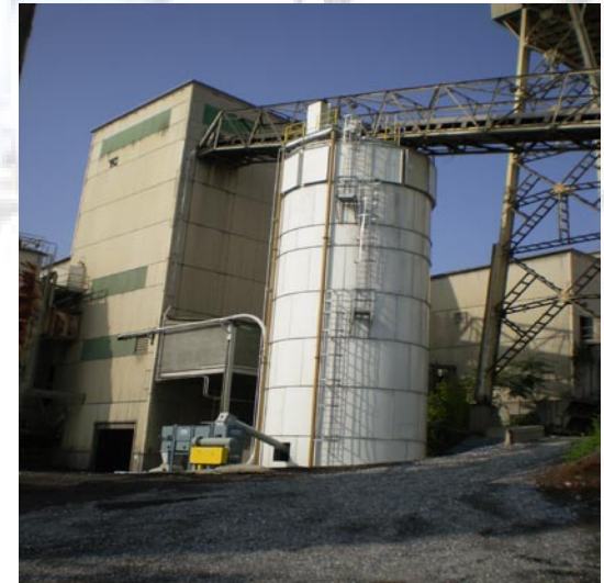
Solid AFR storage and handling 150Mt