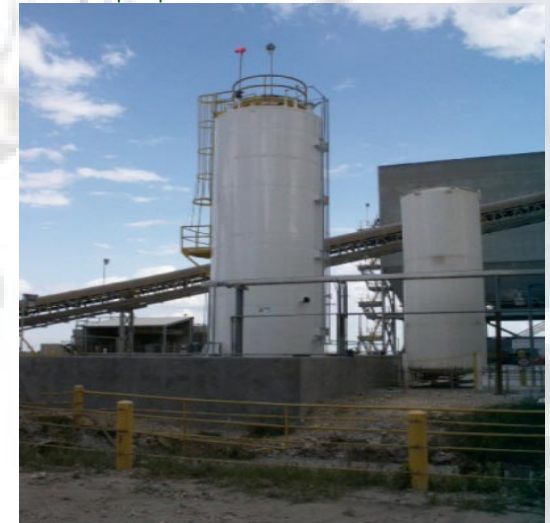
Ammonia tank farm 130,000 lt