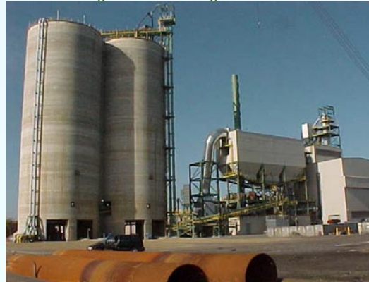
Slag grinding facility